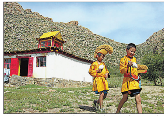
Devout: young monks return home after worship