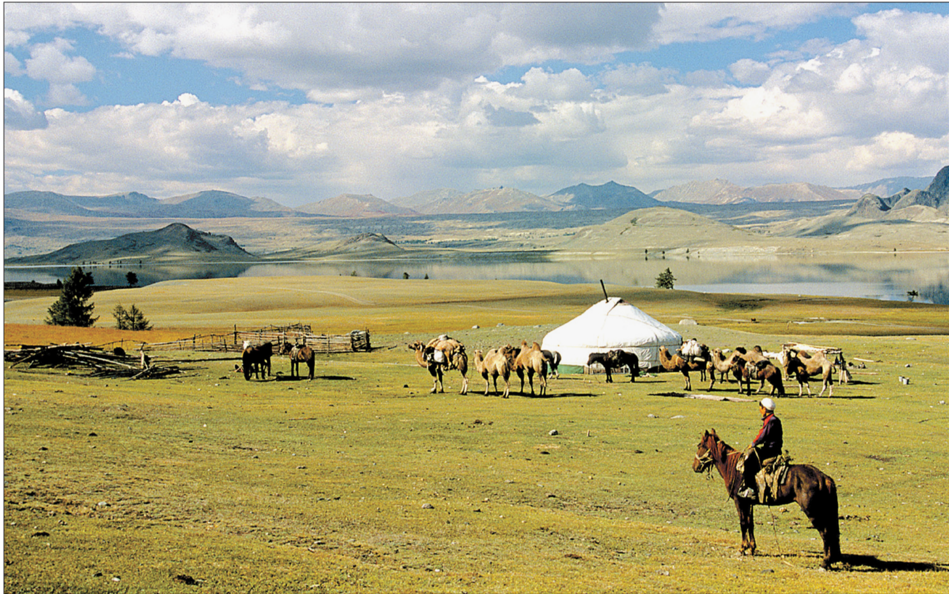
Lost world: a ger camp near Khoton Nuur Lake, Tvanbogd National Park

Horses, wrestling and meat balls. Welcome to Genghis Khan country