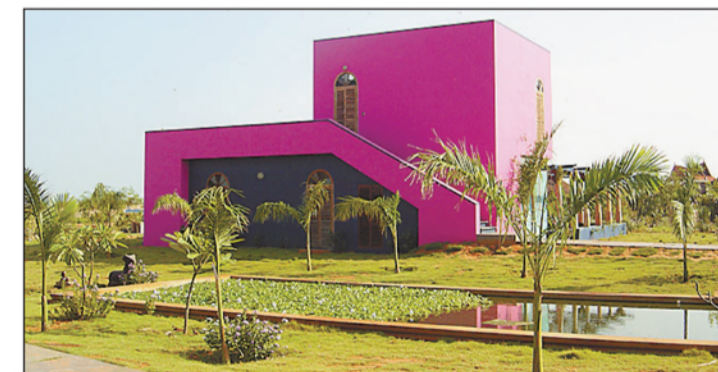
Eye for design: Dune Beach Village's unique bungalows